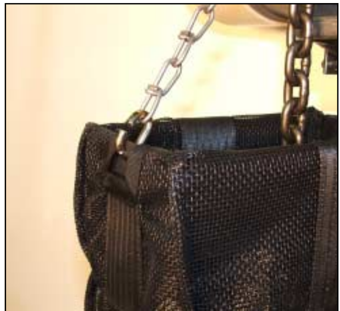
Figure 2. Support Chain Connection at Container