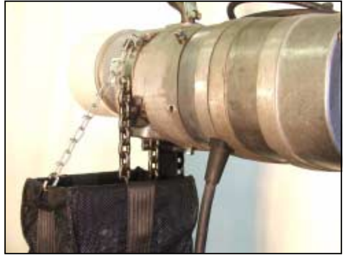
Figure 5. Complete Installation