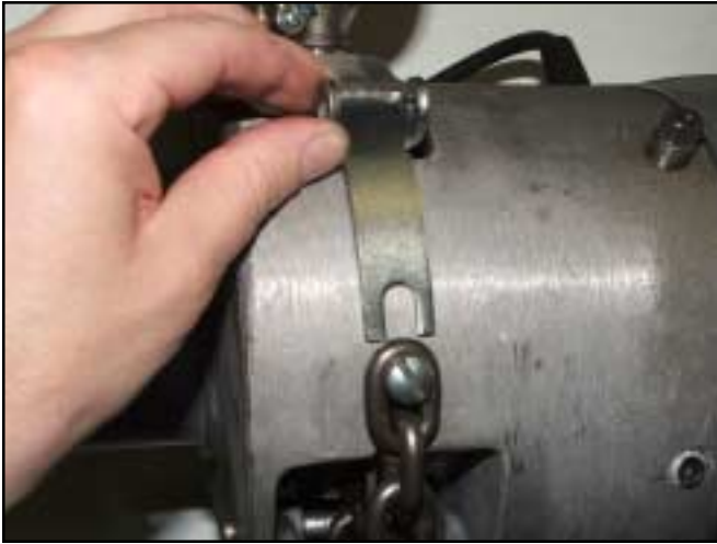
Figure 4. Positioning Upper Hanger Bracket

Read and comply with American National Standard Safety Standard ANSI B30.16 - Latest issues and Hoist Manufacturers Institute "Do's and Do Not's for Electric and Air Powered Hoists."