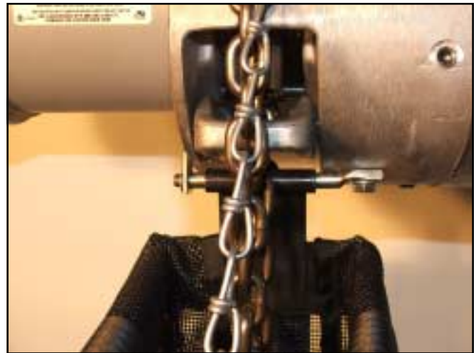
Figure 1. Hinge Pin and Hanger Installation (Pull Cord Model Shown)

For more information contact: American Crane & Equipment Corp. Authorized Distributor Tel: 877-503-2972 Fax: 484-945-0430 sales@americancrane.com www.americancrane.com