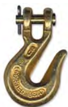
Clevis Grab Part # 62373 CG