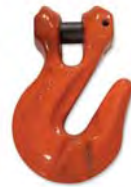
Clevlok Cradle Grab Part # 659225 CLCG