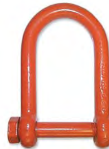
Anchor pin Shackle 5/8 Part # M651P WLL 9,000

For more information contact: American Crane & Equipment Corp. Authorized Distributor Tel: 877-503-2972 Fax: 484-945-0430 sales@americancrane.com www.americancrane.com