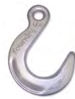
Foundry Eye Part # 474799 FE