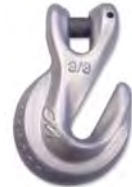
Clevlok Cradle Grab Part # 659725 CLCG