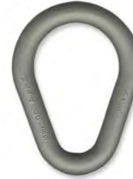
Pear Link 3/4 Part # 95671 WLL 6,000