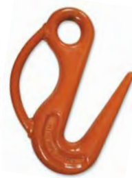
Part # M129H