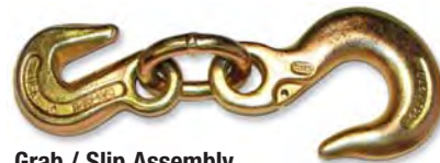
Grab / Slip Assembly