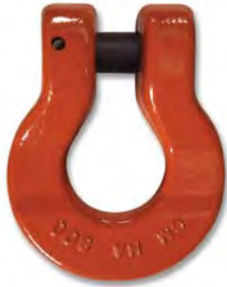
Omega Link 3/8 Part # 644138 WLL 7,100