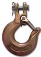
Clevis Slip Part # M6905A CS