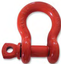
Anchor pin Shackle 3/8 Part # M648P WLL 3,000