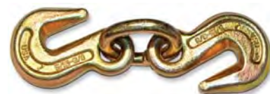
Double Grab Assembly