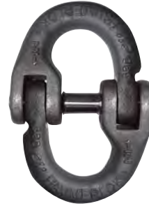
Hammerlok 3/8 Part # 664038 WLL 8,800