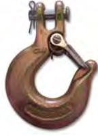
Clevis Slip Part # M6906A CS