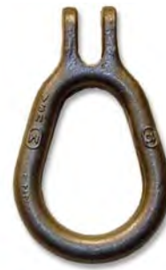
Clevis Link 3/8 Part # 695444 WLL 6,600