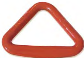
Triangle 3" Part # 90210 WLL 4,000