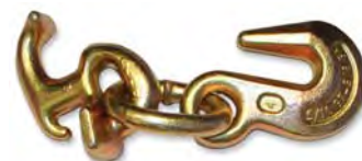
"T" Hook / Grab Assembly