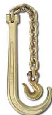
15" Forged J Clevlok w/ 10' 3/8 Chain Part # 97902G8