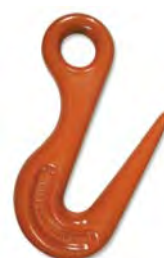
Part # M129