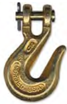
Clevis Grab Part # 62273 CG