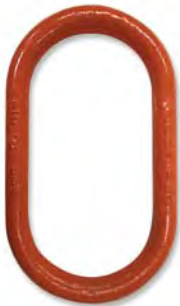
Master Links HA50 Part # 554932 WLL 6,100