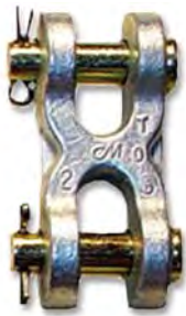
Double Clevis 3/8 Part # 82380 WLL 4,700