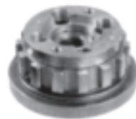
Optional Load Limiter