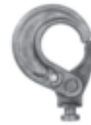
Optional upper Latchlok Hook 3/4 - 1 1/2 ton