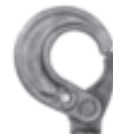
Optional upper Latchlok Hook 3 ton